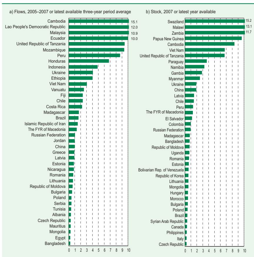
Figure 3. Share of agriculture in inward FDI of selected economies, various years (Per cent)

Democratic Republic, Malawi, Mozambique and the United Republic of Tanzania, the share of FDI in agriculture in total FDI flows or stocks is relatively large (figure 3). This is also true for some non-LDCs, such as Ecuador, Honduras, Indonesia, Malaysia, Papua New Guinea and Viet Nam. The high share in these countries is due to factors such as the structure of the domestic economy, availability of agricultural land (mostly for long-term lease), and national policies (including promotion of investment in agriculture).