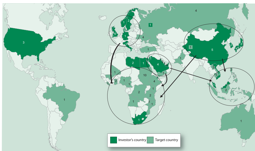
Figure 4. Investor and target regions and countries in overseas land investment for agricultural production, 2006–May 2009 (Number of signed or implemented deals)