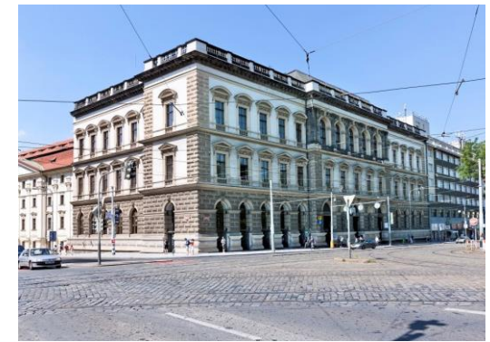
Czech Technical University in Prague.