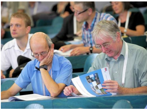
Statisticians from all around the world gathering at the ENBIS conference.