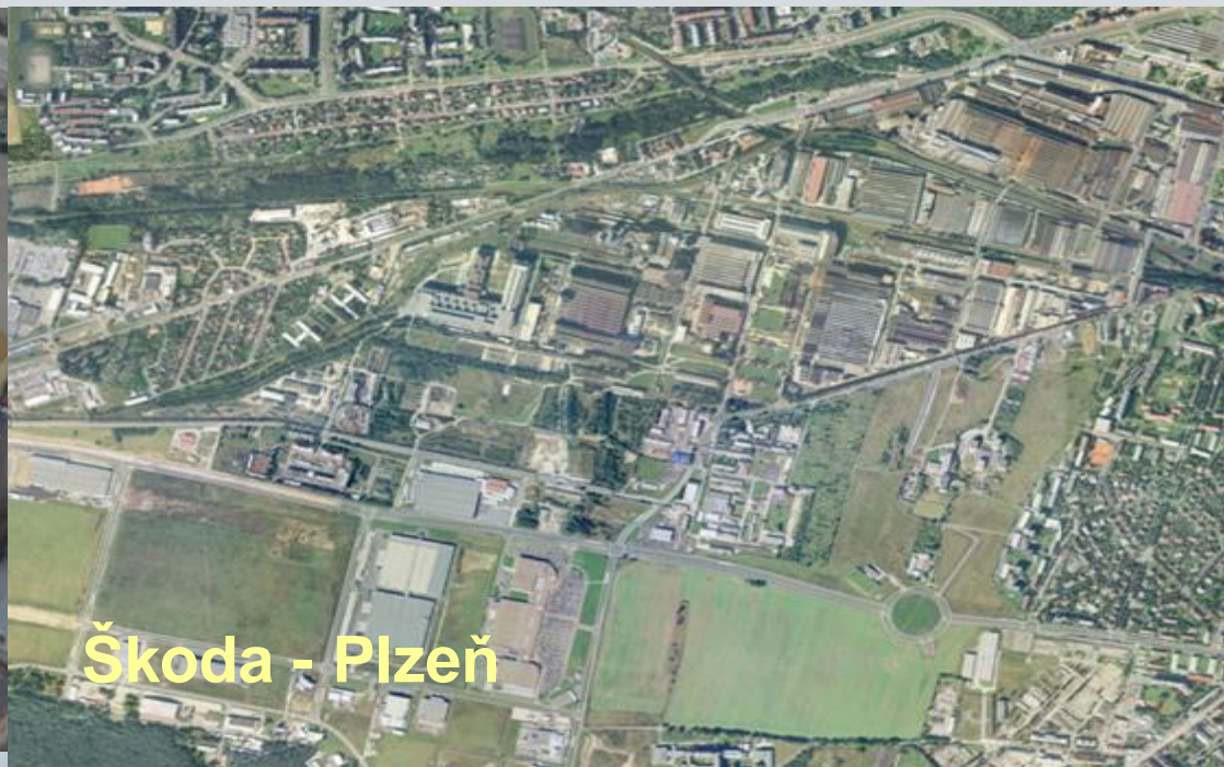
Škoda - Plzeň