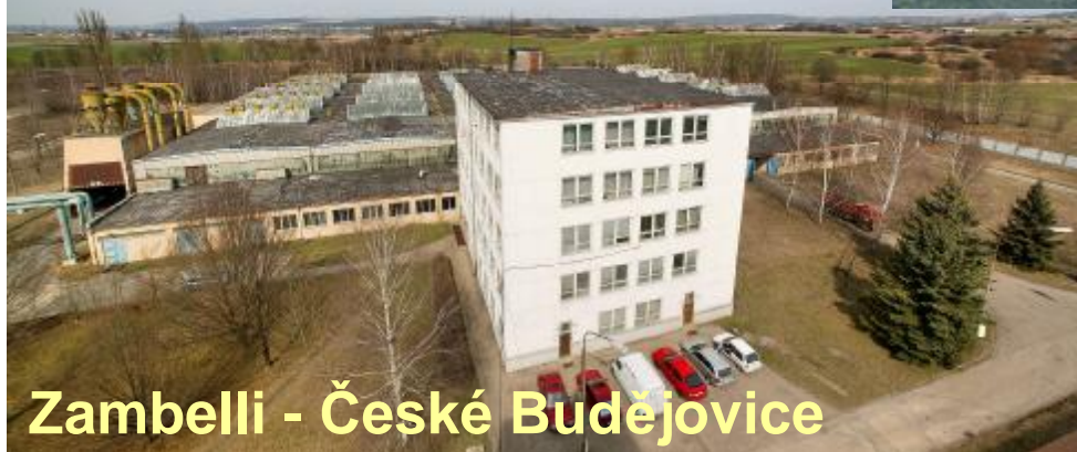
Zambelli - České Budějovice