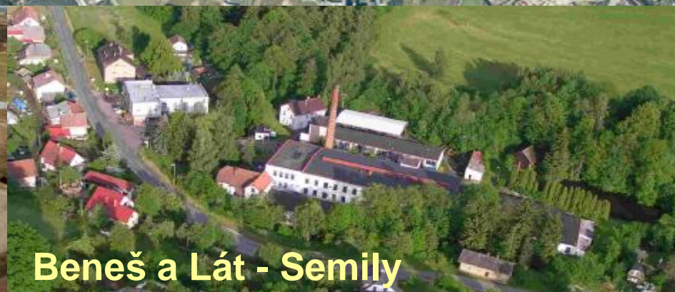
Beneš a Lát - Semily